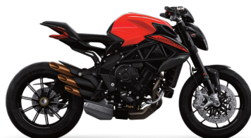
AGO RED/METALLIC CARBON BLACK